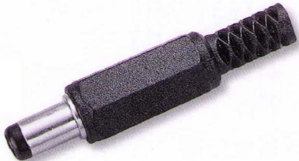
DCP-DA5521-04-WT DCP-DA5525-04-WT Ø5.5X2.1X9.5 m/mL Ø5.5X2.5X9.5 m/mL